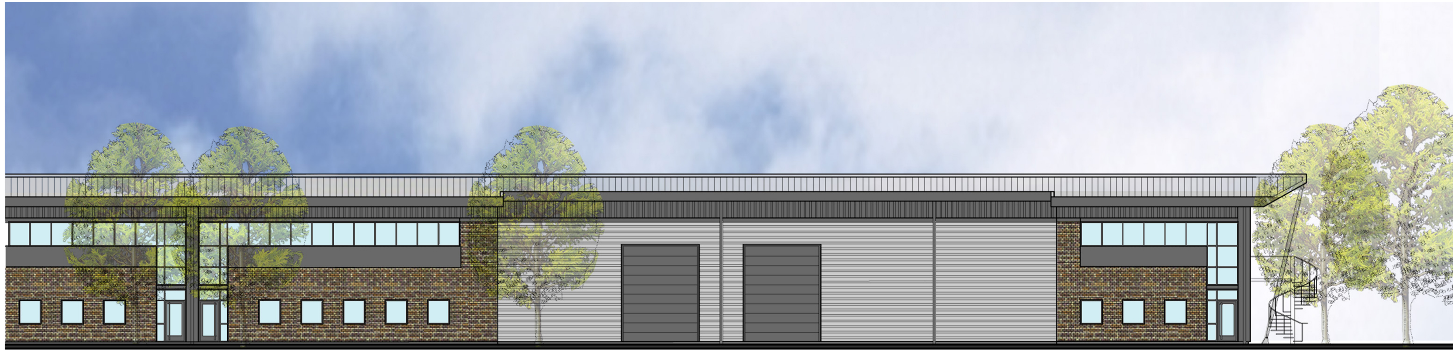
INDICATIVE TERRACE ELEVATION