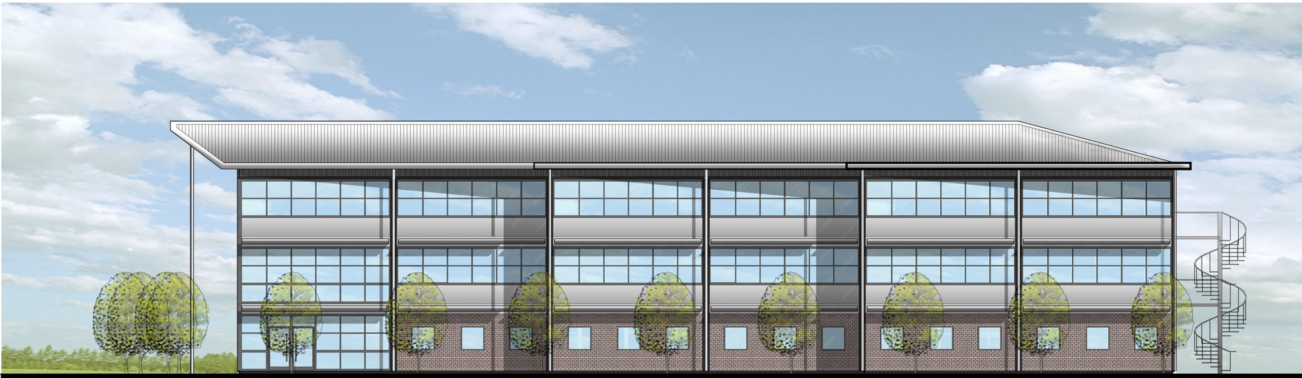
INDICATIVE THREE STOREY OFFICE ELEVATION