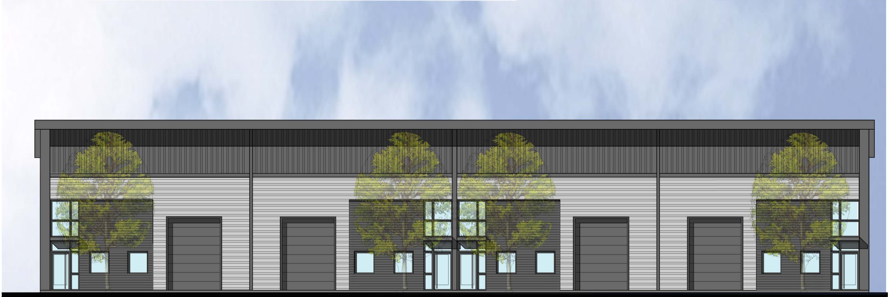
TYPICAL SIDE ELEVATION