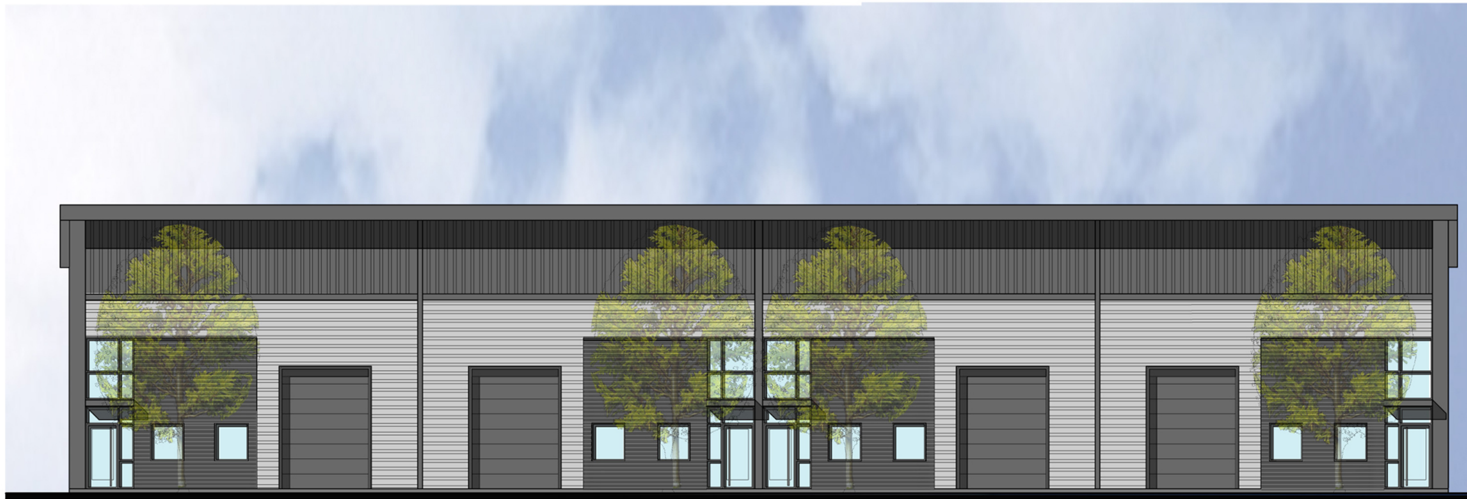
INDICATIVE SINGLE STOREY UNIT ELEVATION