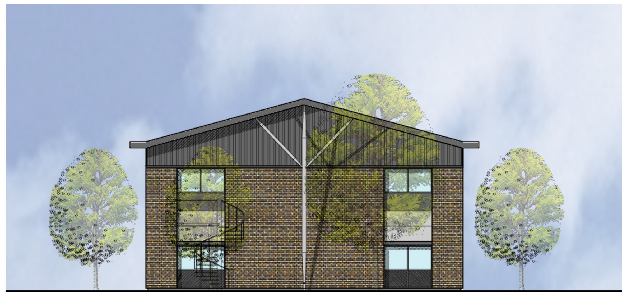
INDICATIVE OFFICE ELEVATION- 2 STOREY- SIDE ASPECT