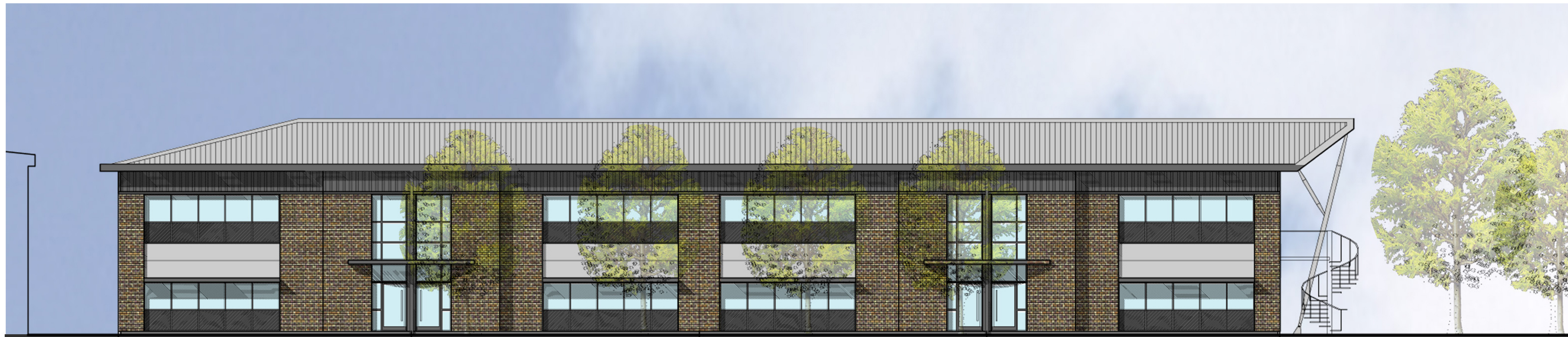
INDICATIVE OFFICE ELEVATION- 2 STOREY