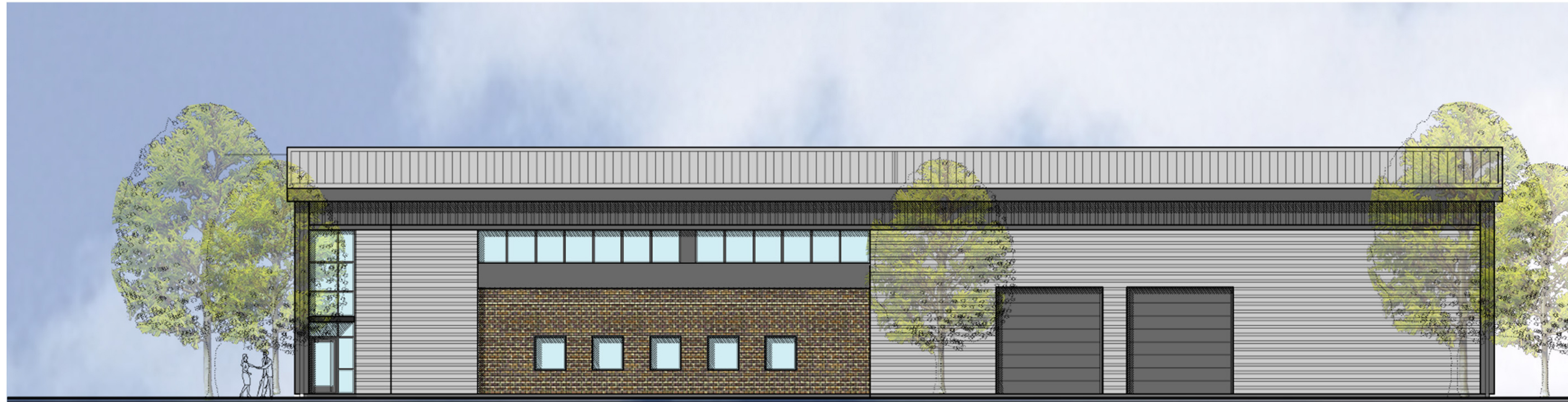
INDICATIVE LARGE DETACHED UNIT ELEVATION

SUBJECT TO STATUTORY CONSENTS BASED ON OS MAP REPRODUCED BY PERMISSION OF CONTROLLER OF HM STATIONARY OFFICE (c) CROWN COPYRIGHT COPYRIGHT RESERVED DO NOT USE ELECTRONIC VERSIONS OF THIS DRAWING TO DETERMINE DIMENSIONS UNLESS SPECIFICALLY AUTHORISED BY MICHAEL SPARKS ASSOCIATES IF USING AN ELECTRONIC VERSION OF THIS DRAWING FIGURED DIMENSIONS TAKE PRECEDENCE AND NOTIFY MICHAEL SPARKS ASSOCIATES OF ANY DISCREPANCIES